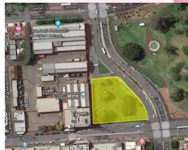
Location: within Murlawirrapurka/Rymill Park alongside Tandanya National Aboriginal Institute

Concepts were considered by the Public Art Reference Group to inform a recommendation for the preferred artist to proceed to undertake delivery of the artwork.